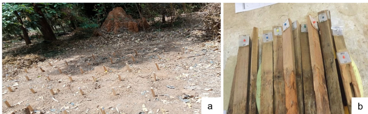
Figure 1: The stakes of A. auriculiformis wood in ground near to termite mound (a), the stakes removed from the ground and dried (b).