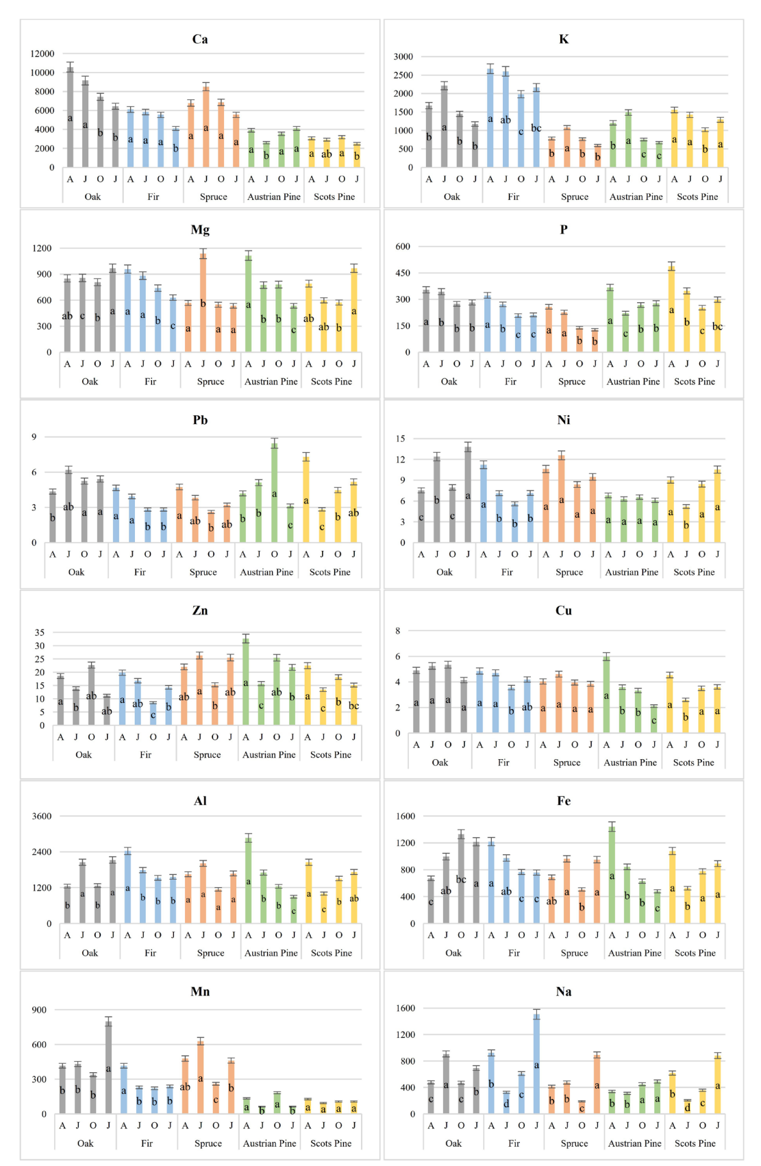
FIGURE 3 Seasonal variation of elements concentration (mg·kg<sup>-1</sup>) in small roots (2-5 mm). (Different letters indicate temporally significant differences in each species at P< 0.05. The vertical bar is standard error.).