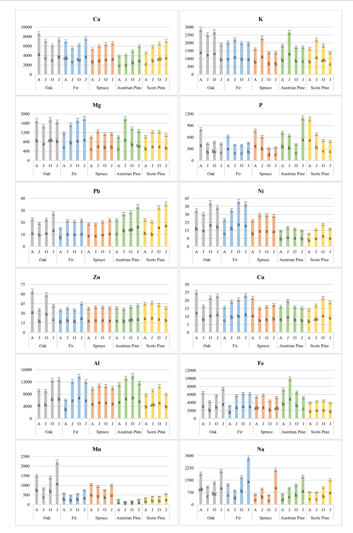
FIGURE I Seasonal variation of element concentration (mg·kg<sup>-1</sup>) in fine roots (0-2 mm). (Different letters indicate temporally significant differences in each species at P< 0.05. The vertical bar is standard error.).